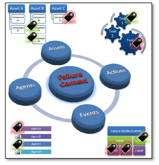
Figure 2. Managing the context of maintenance reference and annotations.

One of our aims is to offer a versatile schema that supports capturing and use of maintenance micro-knowledge by means of tags, with support for optional remarks. The model allows the creation of tag templates configured to map tacit knowledge embedded in maintenance practice. Tag instances are provided by staff in the form of annotations or metadata for approved diagnostics (FMECA core entities). Their title, category and compatibility can be configured and updated by maintenance engineers. Each tag template can be profiled to support the optional addition of: (i) textual notes, (ii) numeric values and (iii) a status lock. These optional fields are used to leverage the tags knowledge value and provide engineers with better insight on how they can expand and adjust the semantics of available tag templates.