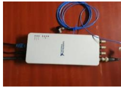
Figure 2(b) Vibration DAQ (NI 9234) with wireless chassis (C9191)