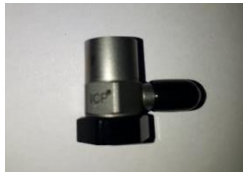
Figure 2(a) IEPE type Accelerometer

(Figure 2(a)) and a Data acquisition card (NI 9234 with C9191 Wireless Chassis) (Figure 2(b)) through the LabVIEW graphical program (Figure 3).